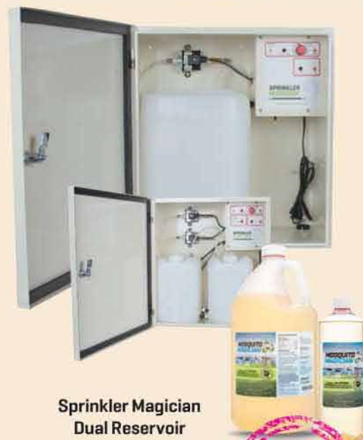
Sprinkler Magician Dual Reservoir

We have many other pest control solutions for residential applications that allow you to apply our mosquito magician concentrate in a variety of ways, depending on the size of your yard. Please inquire for more information.